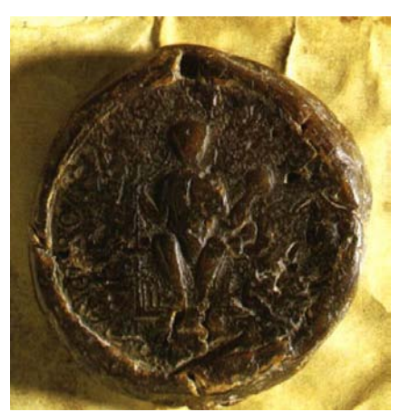
King Coloman's signet on the letter of foundation

The letter of privilege of St Stephen: (http://mek.niif.hu/01900/01955/html/index279.html)