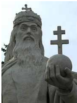
( Saint Stephen of Hungary )

The settlement gained significance after 960 when Géza , the ruling prince of the Hungarians, chose Esztergom as his residence. His son, Vajk , who was later called Saint Stephen of Hungary , was born in his palace built on the Roman castrum on the Várhegy (Castle Hill) around 969-975. In 973, Esztergom served as the starting point of an important historical event. At Easter of that year Géza sent a committee to the international peace conference of Otto I (Emperor of the Holy Roman Empire). He offered peace to the Emperor and asked for missionaries.