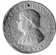
Archbishop Tamás Bakócz

which is the earliest and most significant Renaissance building which has survived in Hungary. The altarpiece of the chapel was carved from white marble.