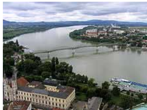
Mária Valéria bridge

The Mária Valéria bridge , connecting Esztergom with the city of Štúrovo in Slovakia was rebuilt in 2001 with the support of the European Union . Originally it was inaugurated in 1895, but the retreating German troops destroyed it in 1944. A new thermal and wellness spa opened in November, 2005.