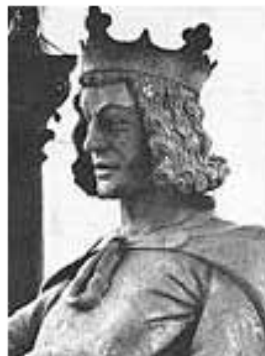
Otto I . Emperor of the Holy Roman Empire

The prince's residence stood on the northern side of the hill. The center of the hill was occupied by a basilica dedicated to St. Adalbert , who, according to legend, baptised St. Stephen . The Church of St. Adalbert was the seat of the archbishop of Esztergom, the head of the Roman Catholic Church in Hungary.