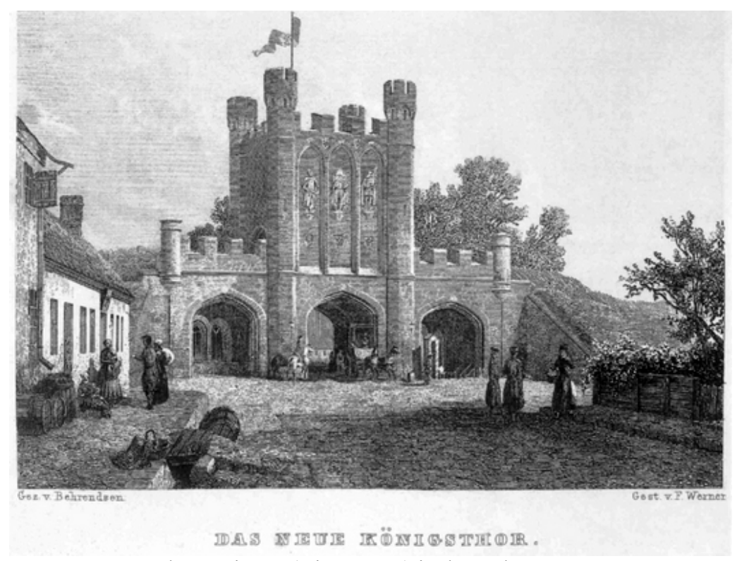
The Königstor (King's Gate) in the 19th century

In the König Strasse (King Street) stood the Academy of Art with a collection of over 400 pictures. About 50 works were by Italian masters; and some early Dutch paintings were also to be found there. At the Königstor (King's Gate) stood statues of King Ottakar I of Bohemia, Albert of Prussia, and Frederick I of Prussia. Königsberg had a magnificent Exchange (completed in 1875) with fine views of the harbor from the staircase. Along Bahnhof Strasse ("Railway Street") were the offices of the famous Royal Amber Works — Samland was celebrated as the "Amber Coast". There was also an observatory fitted up by the astronomer Friedrich Bessel, a botanical garden, and a zoological museum. The "Physikalisch", near the Heumarkt, contained botanical and anthropological collections and prehistoric antiquities. Two large theatres built during the Wilhelmine era were the Stadt (city) Theatre and the Appollo.