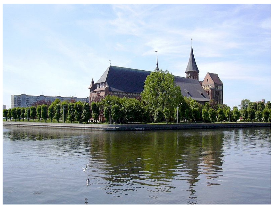
Königsberg Cathedral 柯尼斯堡大教堂