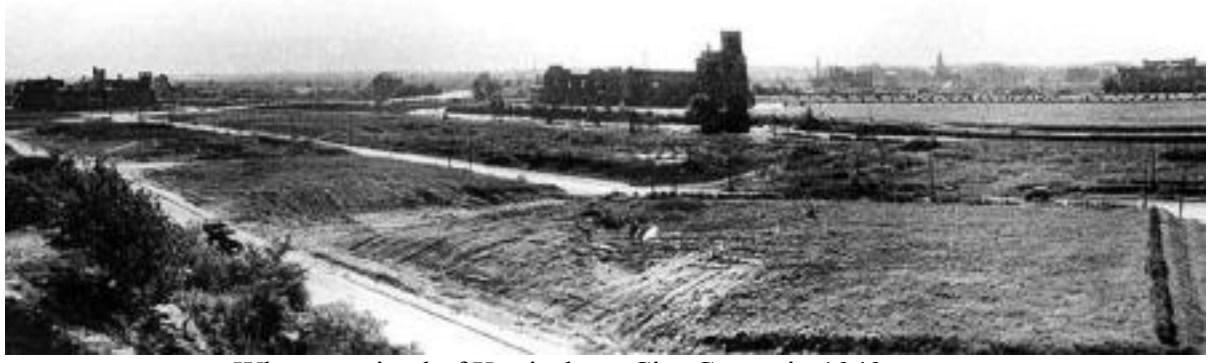
What remained of Königsberg City Centre in 1949

About 120,000 survivors remained in the ruins of the devastated city. These survivors, mainly women, children and the elderly and a few others who returned immediately after the fighting ended, were held as virtual prisoners until 1949. The large majority of German citizens remaining in Königsberg after 1945 died of either disease, starvation or revenge driven ethnic cleansing. The remaining 20,000 German residents were expelled in 1949-50.