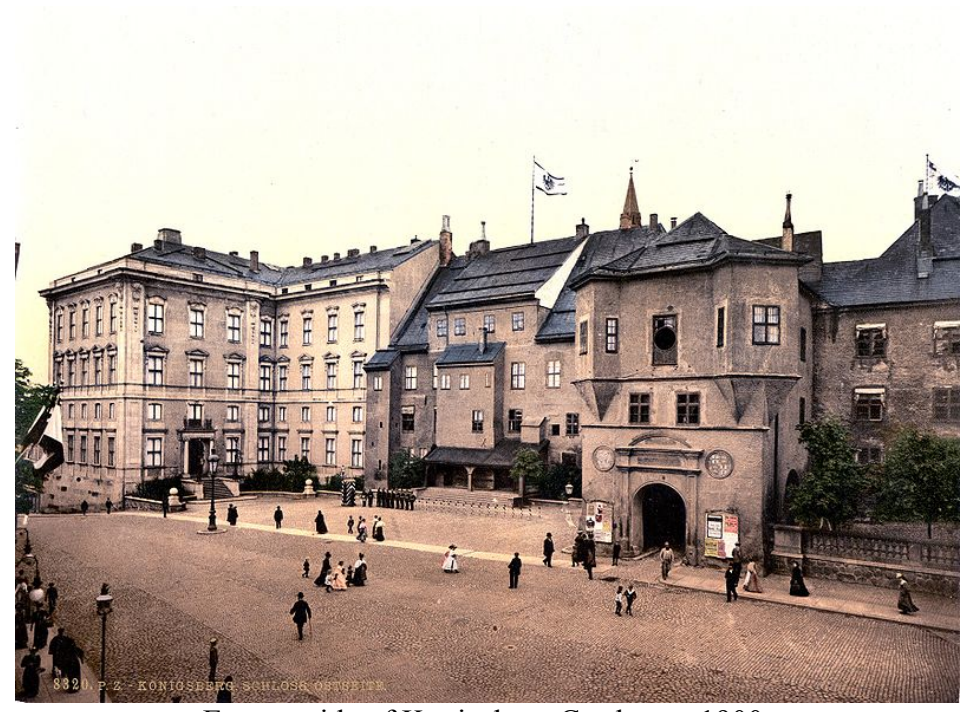
Eastern side of Königsberg Castle, ca. 1900.

Königsberg Castle was one of the city's most notable structures. The former seat of the Grand Masters of the Teutonic Knights and the Dukes of Prussia, it contained the Schlosskirche, or palace church, where Frederick I was crowned in 1701 and William I in 1861. It also contained the spacious Moscowiter-Saal, one of the largest halls in the German Reich, and a museum of Prussian history.