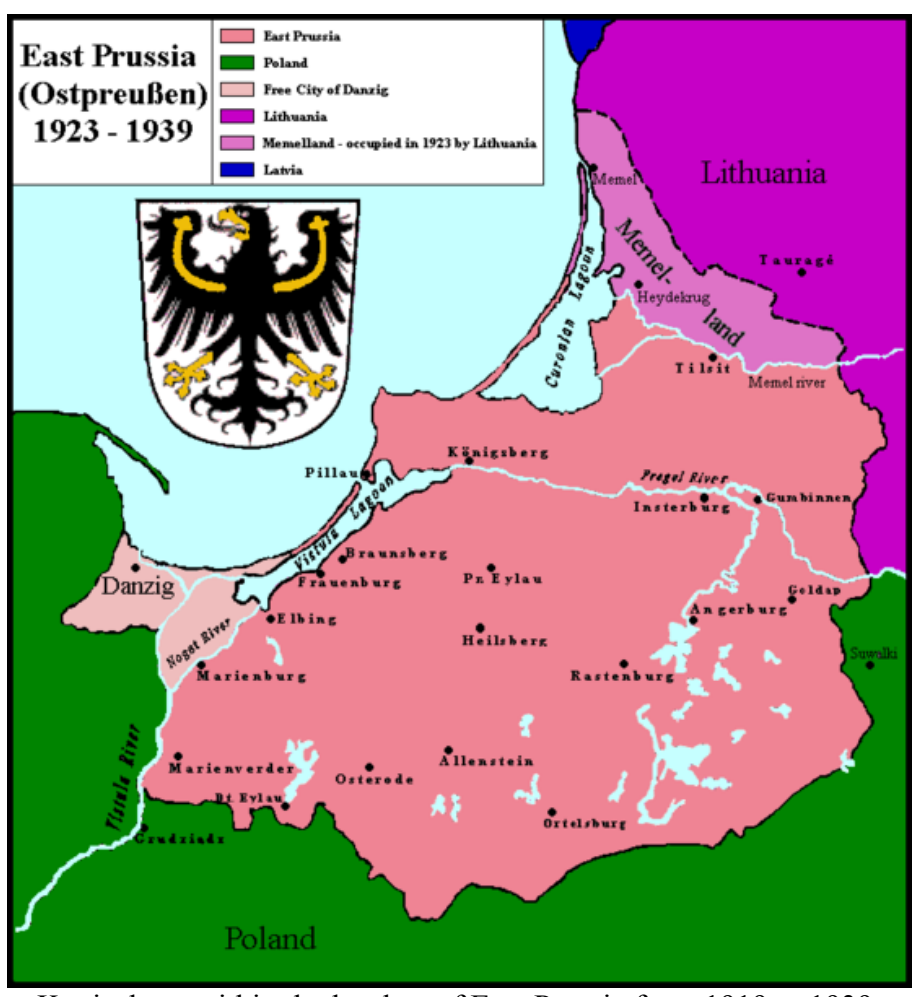
Königsberg within the borders of East Prussia from 1919 to 1939.