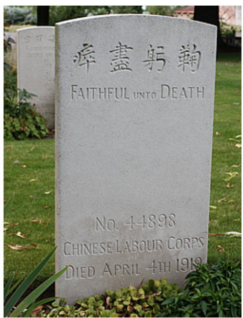
Grave of a member of the Chinese Labour Corps at Lijssenthoek Military Cemetery, Poperinge